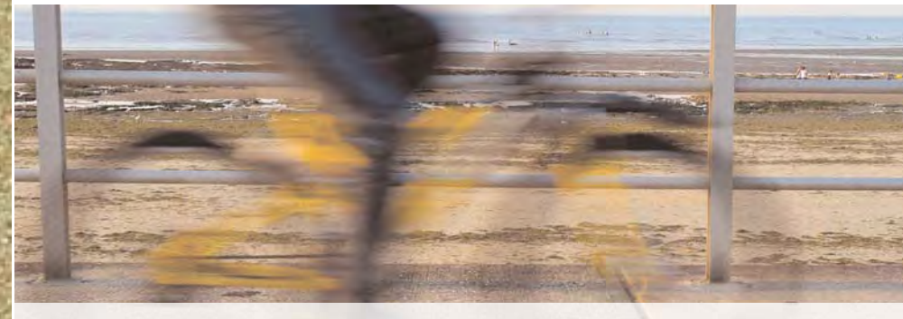
Download the ride details at www.downlandcycles.co.uk

At this point you can head east on a 2.5 mile detour to visit the Abbey and Roman Fort at Reculver, well worth a visit!