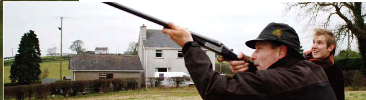
Try your hand at some clays